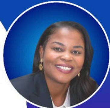
PRESENTED BY: YVONNE SIBANDA